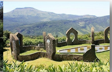
Eco Shrine Centre